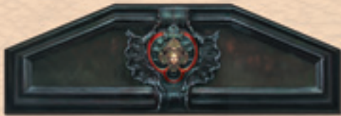
5 Player Screens