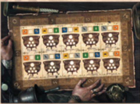
1 Compendium (Game Board)