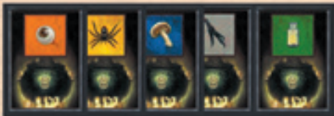
5 School Ingredient Cards