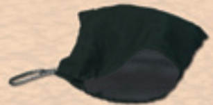
1 Oracle Bag

160 Ingredient Cubes (32 wooden blocks in each of 5 colors):